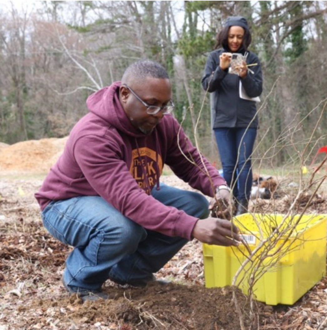
Knowledge, Education, and Elevation for Producers in NC Blueberry Planting

Key Environmental Consulting works with public, private, community-based organizations, and government agencies to deliver equity, justice, and restoration. We also have lived experiences in communities with energy and environmental justice concerns that we draw on to support those on the frontlines.